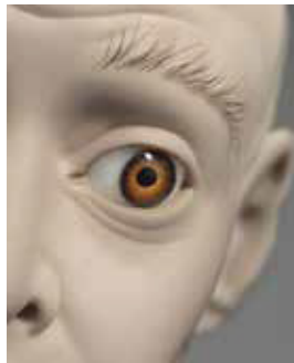
The Sizes of Things in the Mind's Eye