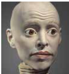
The Nameable Features