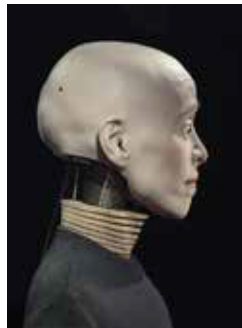
Positions of the Head