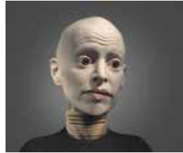
A Moment of Regard